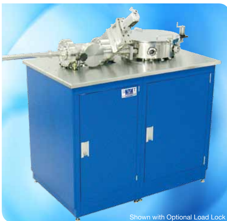
Shown with Optional Load Lock