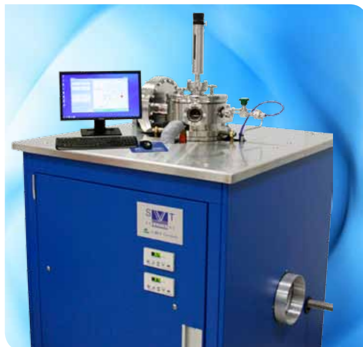
Four Inch ALD System Model ALD-P-100B